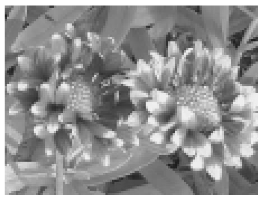
Figure 4 (c): Image reconstructed to original size after size reduction with 4 \times 4 fixed size blocks, PSNR=24.15