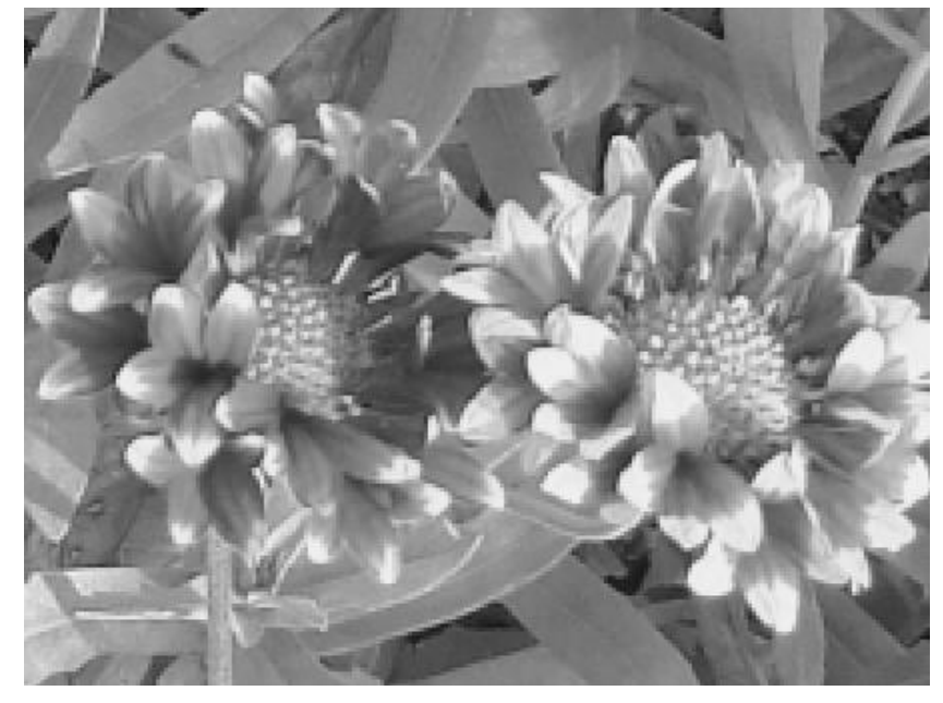
Figure 4 (a): Image reconstructed to original size after size reduction with 2 \times 2 fixed size blocks, PSNR=25.36

The properties of contracted images are summarized in Table 1. Space saved is calculated with reference to image I , repetitive application of the preset function can be implemented to further diminish the image size. The 114 \times 85 size (Fig. 4c) can be achieved either by considering partitioning with block size 4 \times 4 or by repeated application of the scheme (iteratively) twice by considering block size 2 \times 2 in each step. In both the cases the contracted image will be approximately the same. The quality of processed digital image can be done subjectively and objectively. PSNR is one of the widely used objective quality measure [10].