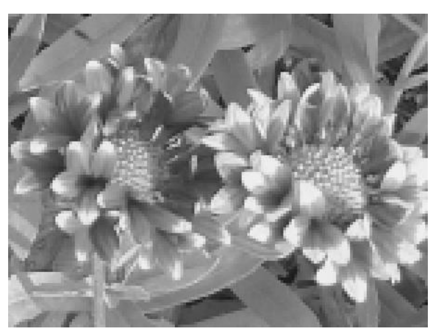
Figure 4 (b): Image reconstructed to original size after size reduction with 3 \times 3 fixed size blocks, PSNR=25.95