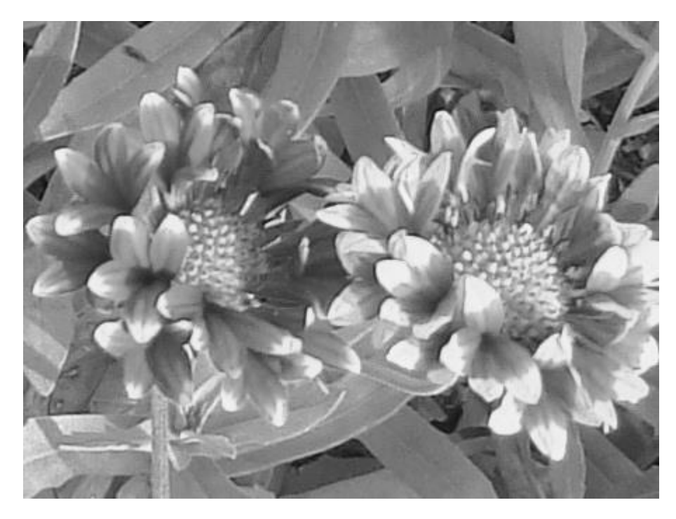
Figure 2: Original image I