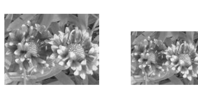
Figure 3: Image with block size (a) n = 2

Using the pixels of reduced output image, the reconstructed images (Fig. 4a, 4b and 4c) are obtained to match the dimension of I. Quality of reconstructed images is given by the PSNR (listed in table 1). But using the subjective quality measure it is clear from Fig. 4a, 4b and 4c that as the n increases, the quality of reconstructed images minifies.